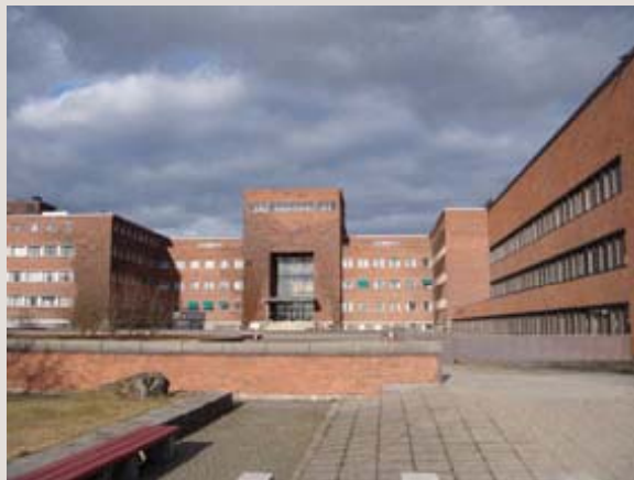
Physics building – planned as main entrance of Blindern Campus

Today the UiO has 28000 students (autumn 07) and around 4,600 employees.