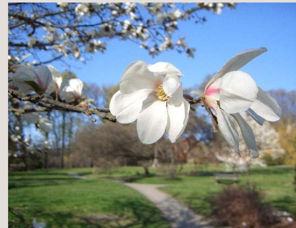
Botanical Garden