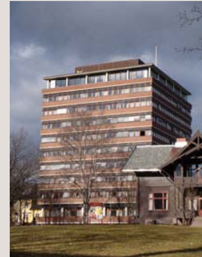
UiO – Central Administration Building

The University of Oslo (UiO) is Norway's largest and oldest institution of higher education. It was founded in 1811 when Norway was still under Danish rule, and thus celebrates its 200 years' anniversary in 2011.