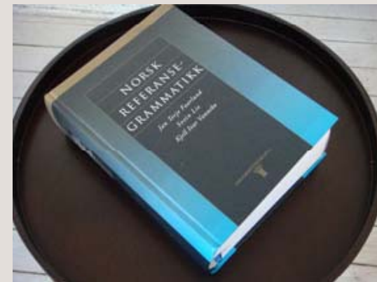
"Norwegian Reference Grammar" – written by three scholars from Department of Linguistics and Scandinavian Studies