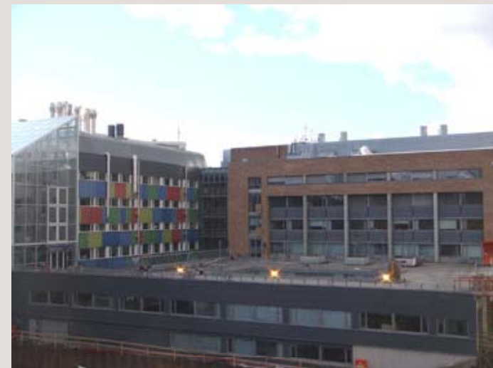
Oslo Innovation Center with Dept of Media and Communication