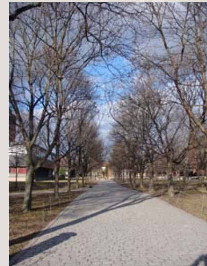
Above: Faculty of Humanities buildings Below: Blindern Campus main road.