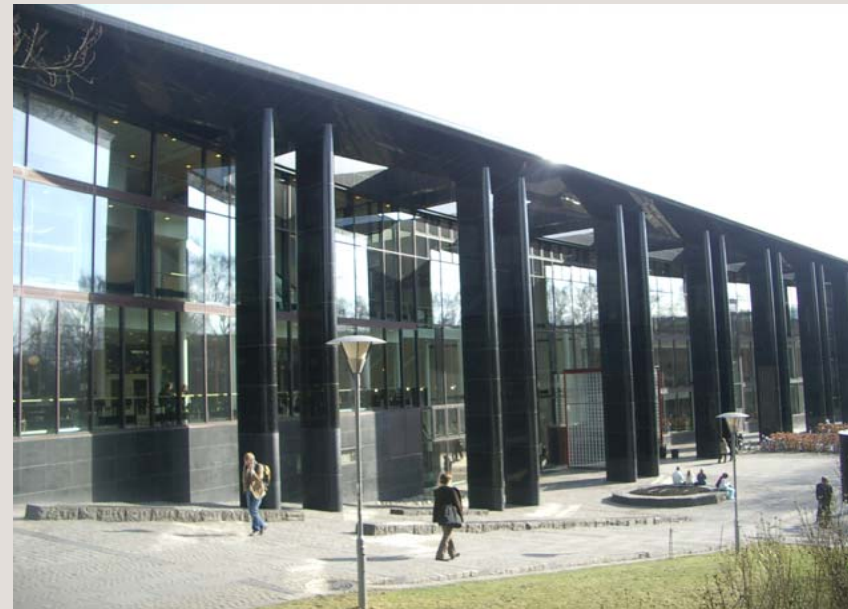
Library of Humanities and Social Sciences