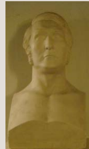
Bust of Henrik A. Wergeland by Julius Middelthun 1887