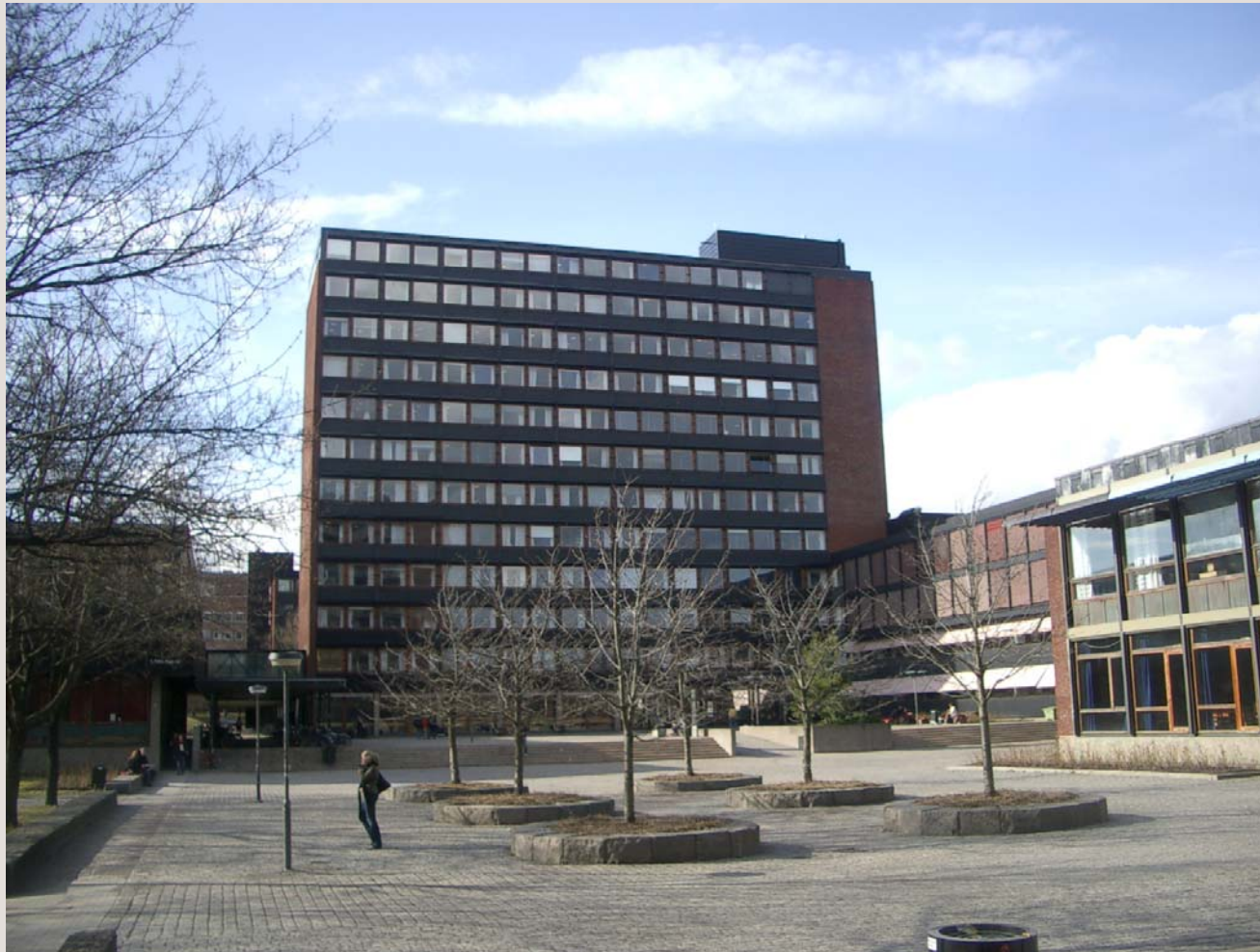
The Faculty of Humanities' main buildings.