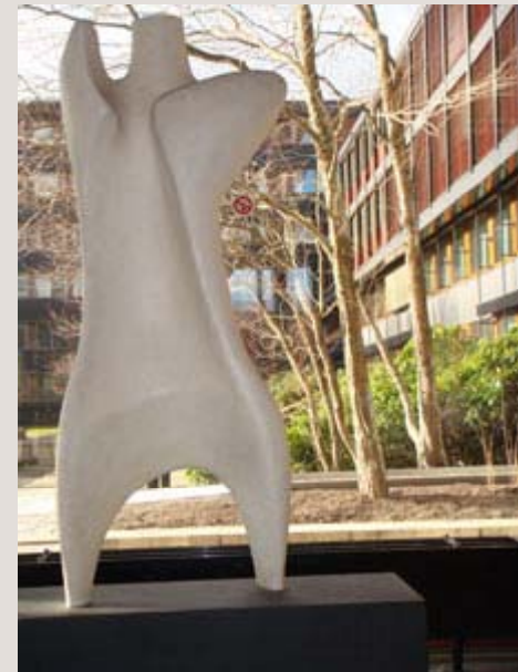
P.A. Munch's and Henrik Wergeland's building behind "Torso" 1958 by Aase Texmon Rygh.