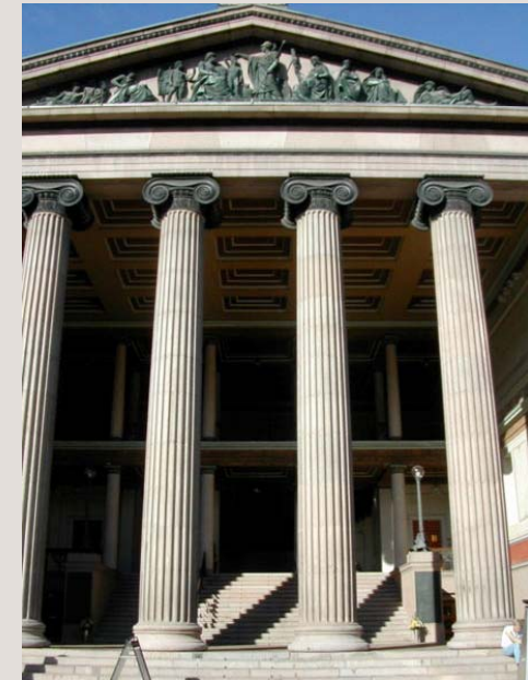
University of Oslo, City Center, Domus Media