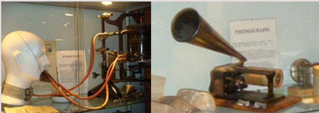
Old scientific equipment: Kymograph and Phonograph (Used by Phonetical Institute)

European and Asian languages, linguistic and philological studies, area studies concentrated on the history and culture of particular regions, aesthetic studies, computer and media studies as well as a large and diverse group of cultural, historical and philosophical subjects.