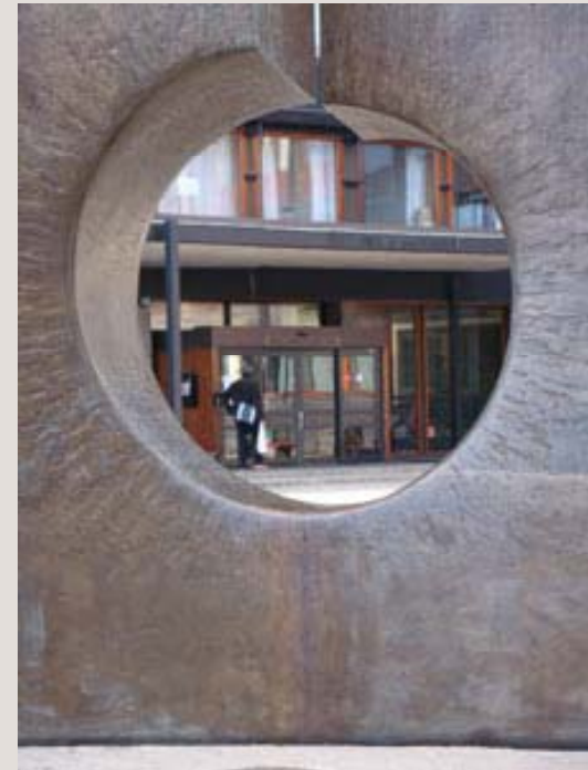
Entrance to faculty building seen through "Brudt form" 1980 by Aase Texmon Rygh /Bono 2005

In January 2005 the faculty was renamed, and became The Faculty of Humanities.