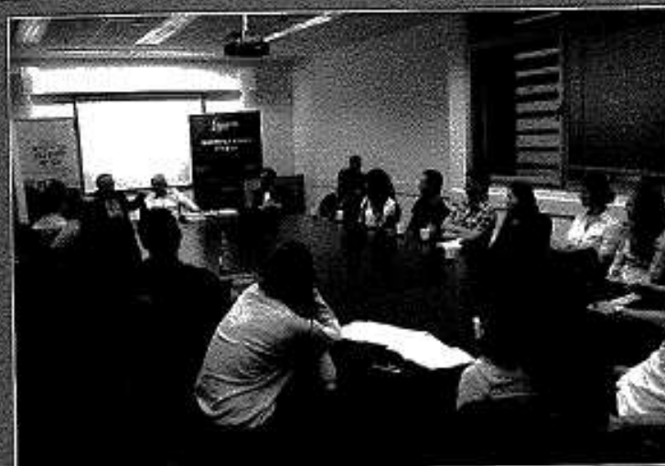
Students studying at the Cardozo-Kagan Jewish Leadership program.

“And that’s a core issue here in Israel – secular students reach a barrier when it comes to their Jewish identity, and they won’t cross it unless someone reaches out a hand and invites them into a world that also belongs to them. Young Israelis go to India and Thailand and are fascinated by philosophy