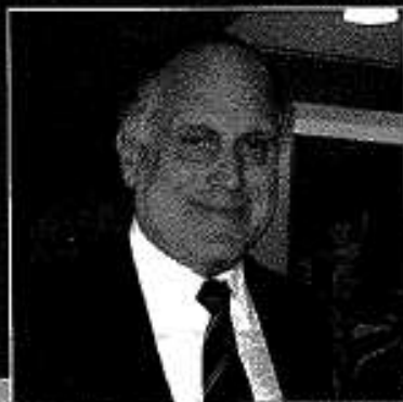
Amb. Ronald Lauder, founder of the Lauder School of Government, Diplomacy and Strategy