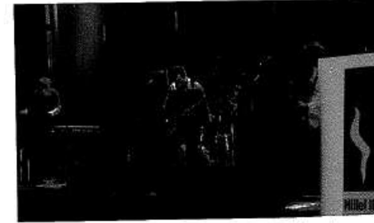
400 students hear the Rockfour performing live at the Hillel event

mostly attend Hillel events because of the quality of the programming, rather than for the social element. The Shabbaton is our opportunity not only to give worthwhile events, but to create a social dynamic that promotes discussion, makes people think and helps them to go beyond