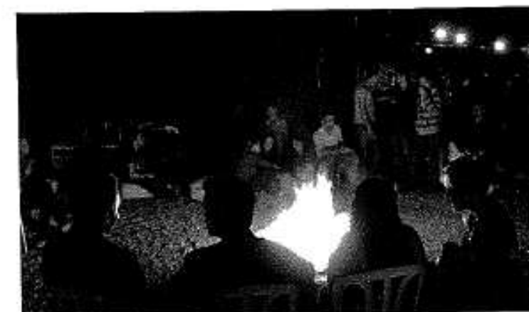
Commemorating the Bonfire of the Israeli People two thousand years ago.