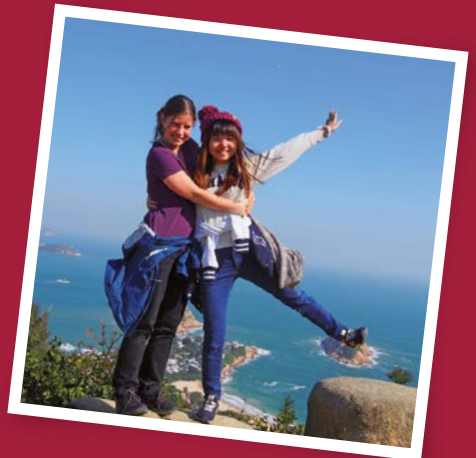
... and a few months later during a visit to Hong Kong