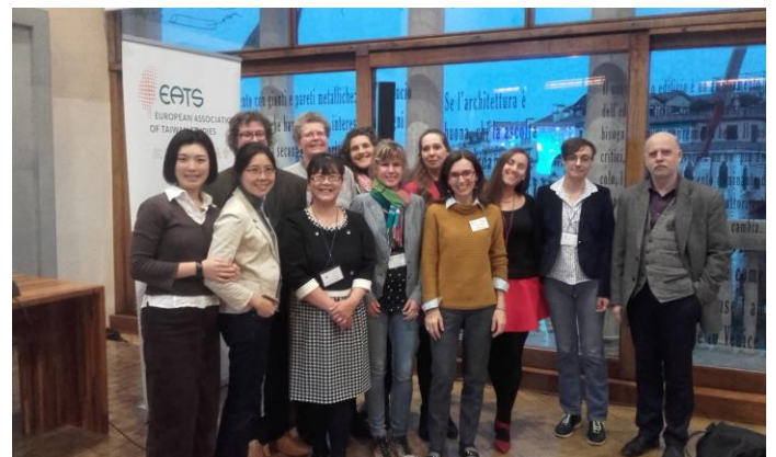
EATS Board members, local organiser and auditor

In tune with the research profile of the Department of Asian and North African Studies, centred upon linguistics, Chinese and Taiwanese classical and more recent literature and translation studies, the theme of this year's conference was 'Translating Taiwan'. However, the scope of